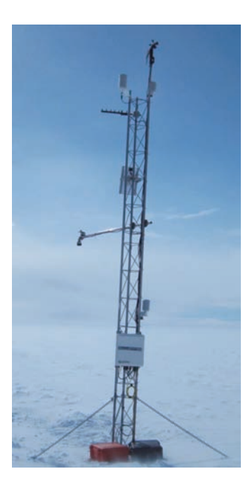
Fig. 1. Lorne AWS, consisting of two R.M. Young RTD and one Vaisala HMP 155- all three in Gill Radiation shields, LI200X pyranometer, SR50A ADG, and R.M. Young Wind Monitor system. Within the electronics enclosure is a Paroscientific pressure sensor.