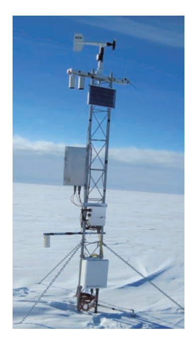
Fig. 2. Kominko-Slade station prior to servicing. Instrumentation consists of a Weed platinum resistance thermometer (PRT), a two-junction thermocouple temperature-difference sensor set (measuring temperature difference between the sensor boom at top of the tower and at the half meter mark above the snow), an R.M. Young Wind Monitor, a Vaisala HMP 45 for humidity, and a Paroscientific pressure sensor within the enclosure.

repairs and servicing along with any AWS station removals or new installation of AWS systems.