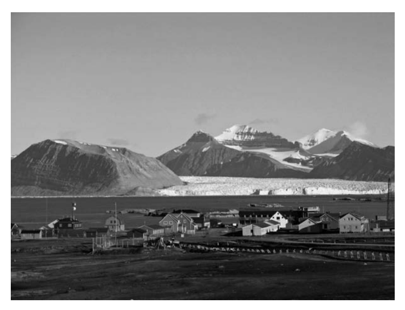
Fig. 3. Areal photograph showing stations of other countries around Indian research base 'Himadri' in Ny-Ålesund.