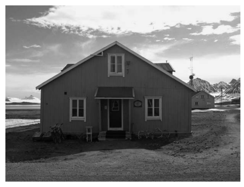
Fig. 2. A close view of the Indian Research Base 'Himadri' at Ny-Ålesund (Arctic).