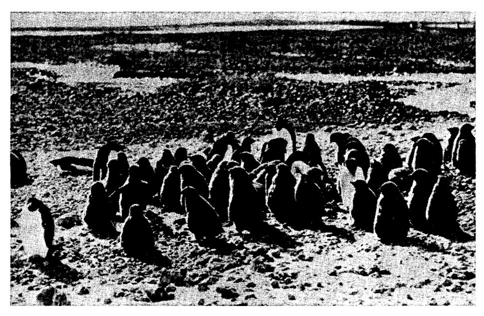
Fig. 2. The B4 colony on January 21.

92 pairs were breeding and their 171 eggs were found on November 21 when we arrived at this rookery. As breeding proceeded, many parents lost their eggs due to predation by the skua and desertion by the parents. The first chick was hatched on December 15, and the last one, on December 30. The first sign of crèche formation was observed on January 1 when two or three huddles consisting of 3–6 chicks were formed in the empty space among the nests. On January 5, more than half of the surviving chicks entered crèches and their parents left the colony to gather food. All the chicks except two in one nest entered crèches on January 10. On January 12 the last two chicks entered the crèche. On January 21, 53 pairs out of the 92 continued breeding successfully, and 75 chicks survived (Fig. 2).