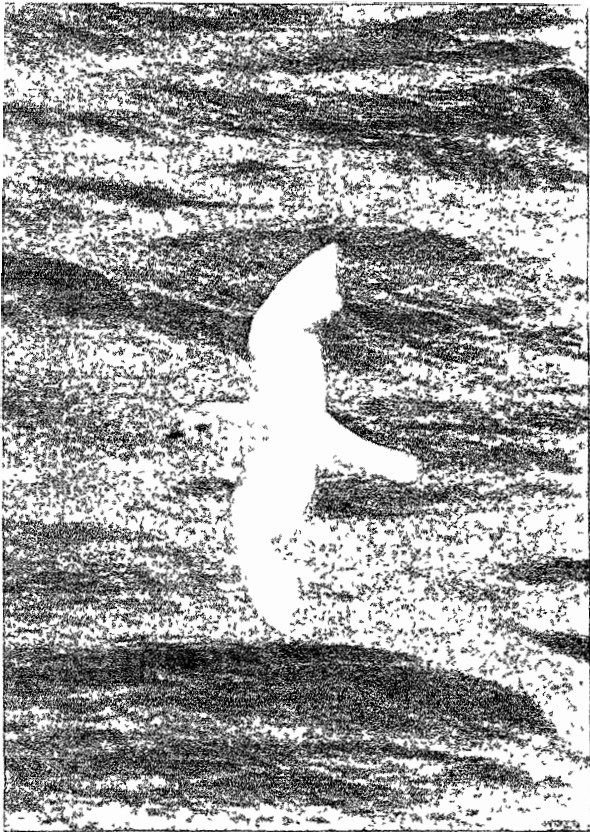
Photo 12 Snow petrel