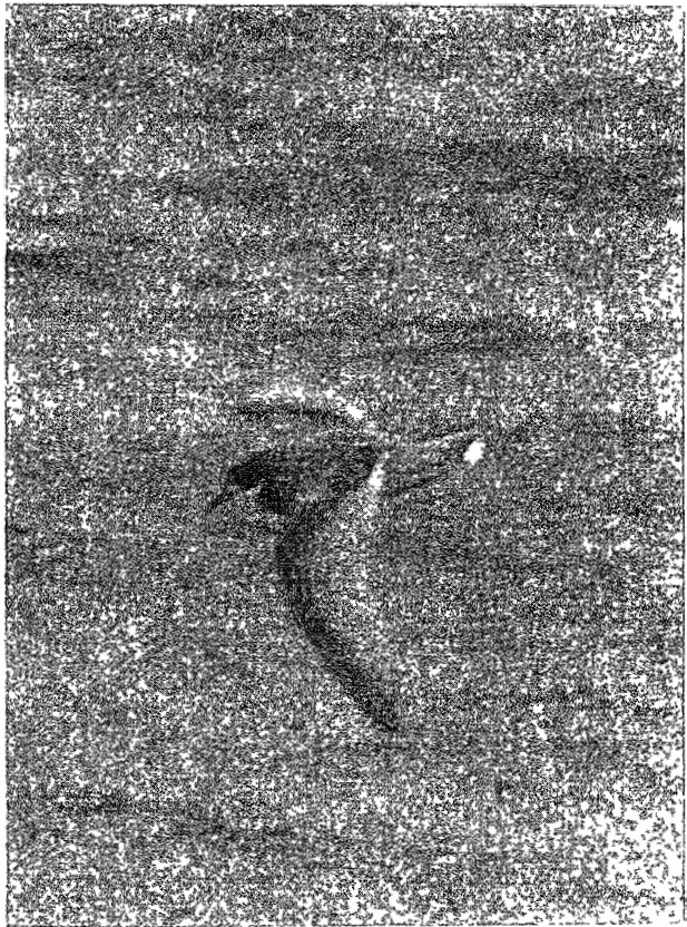
Photo 13 Blue petrel