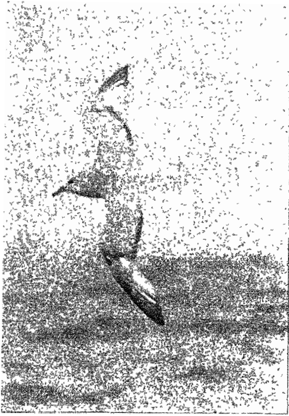
Photo 10 Silver-grey fulmar, topside