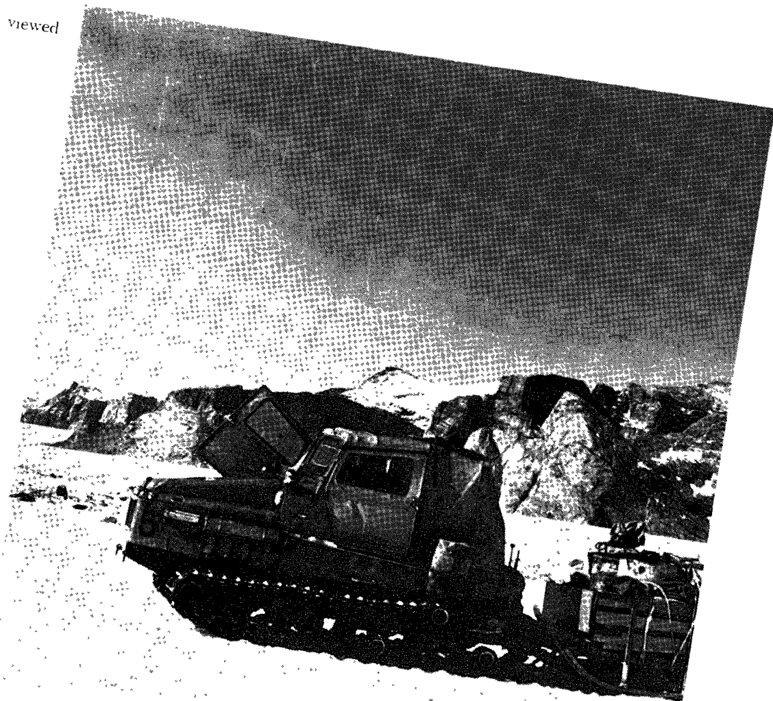
写真 4. 福島岳を西方から望む.