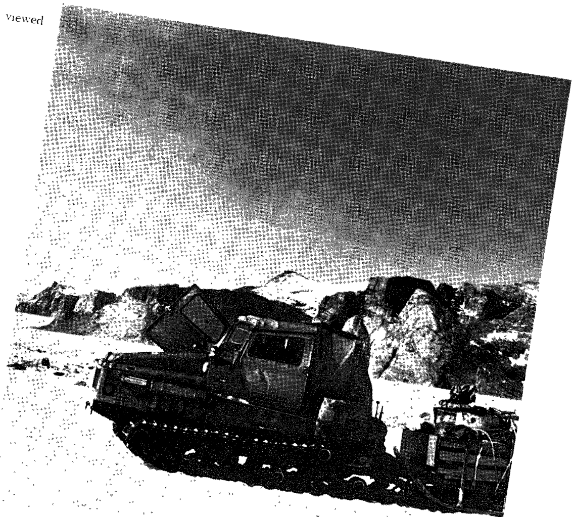
写真 4. 福島岳を西方から望む.