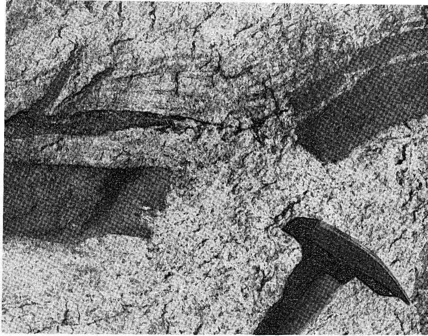
写真 17-1), 2), 3) さくろ石-黒雲母花崗閃緑 岩質片麻岩体中の塩基性変成岩体の産状.

Photo. 17-1), 2), 3) Photograph showing the modes of occurrence of basic metamorphic band (black part) in garnet-biotite granodioritic gneiss.