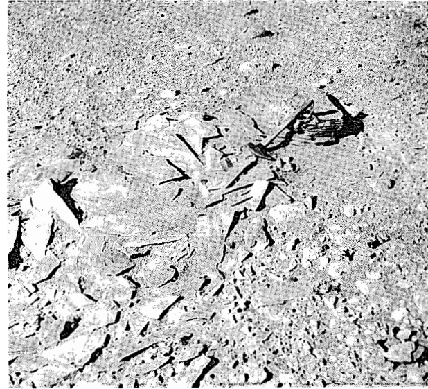
写真 8. 片状岩迷子石に見られた機械的風化作用 (東オングル島).

Photo. 6. Glacially polished surface and erratic boulders lying on it (northern part of Skallen district).