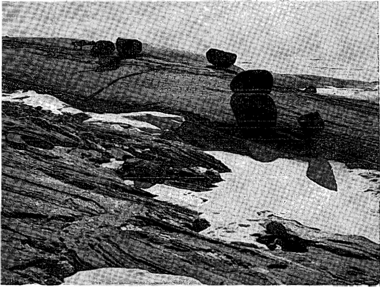
写真 6. 氷蝕琢磨面と迷子石 (スカーレン地区北部).

Photo. 6. Glacially polished surface and erratic boulders lying on it (northern part of Skallen district).