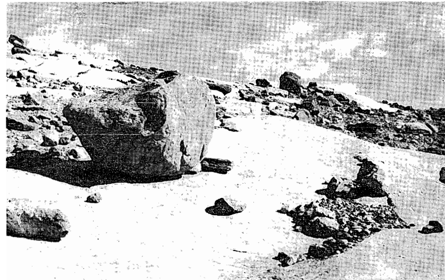
写真 9. 巨礫と共に砂粒程度のものまで混つたまま山腹緩傾斜部に残る迷子石群 (スカルブスネス地区南部).

Photo. 7. Exfoliation acted on granitic gneiss. In this case plates are usually thin and are easy to break down into small pieces (eastern part of Langhovde district).