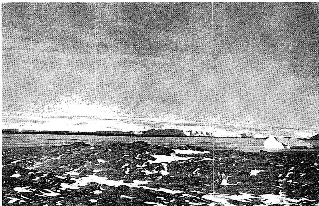
Marginal cliff of the inland ice on the opposite coast of the Syowa Base. The foreground is East Teōya Island. The Ongul Strait between the continent and the island is covered only by slush. (taken by T. Tatsumi on March 31, 1957)