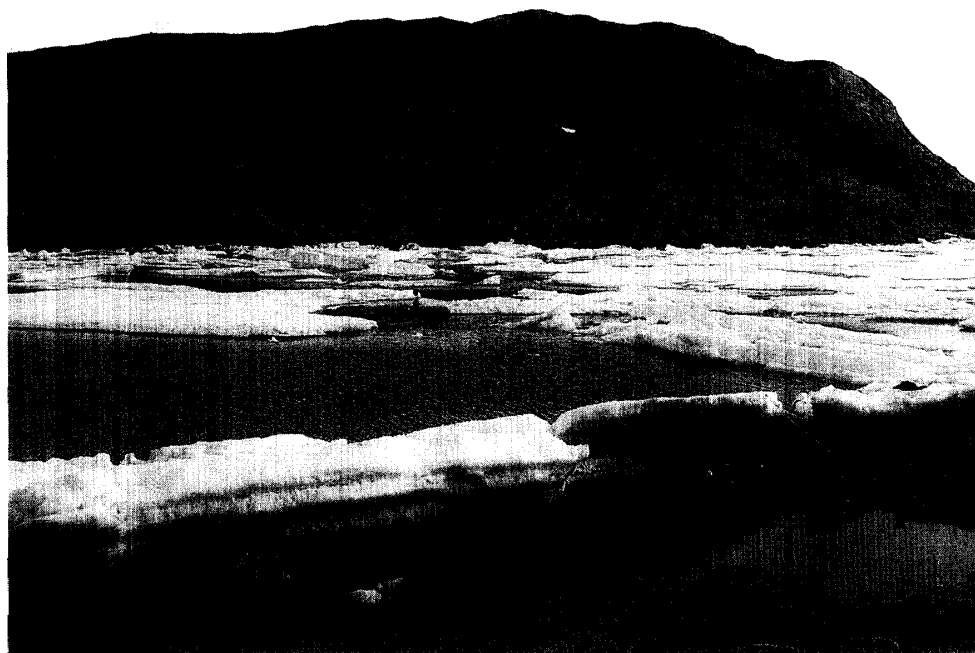
Fig. 2. Landscape of sampling site.