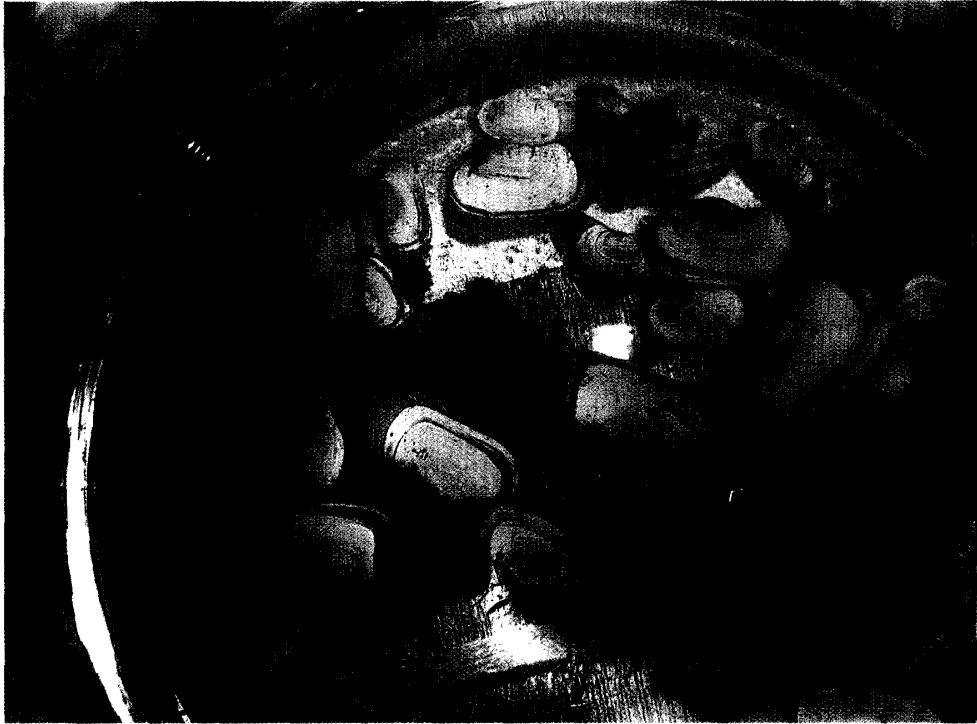
Fig. 5. Laternula elliptica . Well-developed siphons are extended when in seawater.

difference in growth rate was observed among different parts of the shell. Laternula shell was elongated, elliptical and thin, inflated with a truncated posterior end (Fig. 5) with resilium under the umbo, and the chondrophore protruding. The distance between the fluorescent mark and the inner surface was measured using the dorso-ventral section of the shell. In the umbonal region, especially in the chondrophore, relatively rapid growth was observed in all individuals examined (Fig. 4). In contrast, in the central part of the dorso-ventral section, a low growth rate was observed. There was a significant difference in growth rate between the umbonal part and the central part. Similarity of growth performance between the left and right valves was also observed. In a small individual (shell length: 8 mm), the distance from the position of the growing edge at the time of TC incorporation to that of the growing edge 90 days after immersion was 70 \mu\text{m} in the chondrophore. The growth rate of this species, which lives in low temperature throughout the year, may not be significantly lower than that of the temperal or tropical species.