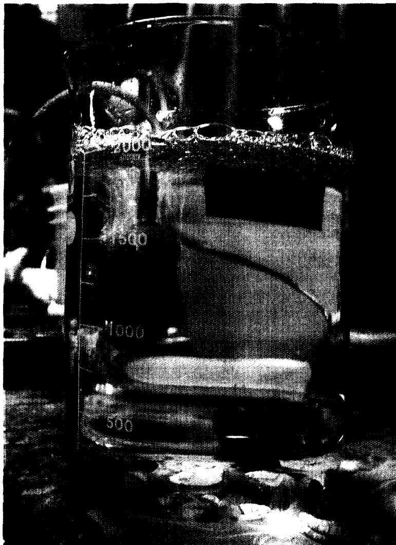
Fig. 3. Laternula elliptica exposed to tetracycline marking solution.

After the net retrieval, the bivalves were immediately sorted and stored in plastic bottles filled with seawater and kept at the temperature of 2–5°C. These were quickly transferred to a plastic water tank in a cold-storage room at 0°C on the icebreaker Shirase . Seawater temperature was kept between about 0 and 3°C during the experiment. Sand from the sampling site was collected and transferred to the bottom of the tank as in situ , and the water in the tank was circulated by using an electric pump with filter. The experiment was started 3 days after capture to allow for adjustment of physiological conditions. During the experiment, bivalves were fed twice a day on phytoplankton, mainly diatoms, and detritus except in the period of marking with fluorescent substance.