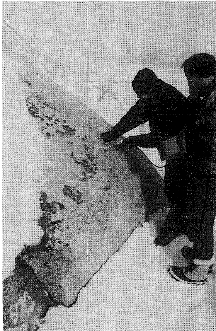
Fig. 2. Members of the field party in Granite Harbour, southern Victoria Land, measure chlorophyll-a fluorescence in thalli of Buellia frigida , bordering a snow patch (in front) on a southeast-exposed siliceous rock (December 1994).

1989) or Umbilicaria aprina (SCHROETER et al. , 1994) can regain metabolic activity at temperatures below 0^{\circ}\text{C} if they were freshly covered by snow crystals. Field and laboratory experiments which carefully prevented any melting have revealed that the lichens must be able to take up water vapor from the snow crystals that touch the thallus or surround the thallus at a small distance. Transport of water vapor into the thallus can be explained if the water vapor pressure gradient between ice and the dry thallus is considered. Since we know from other studies that lichens start photosynthesizing at water potentials around -30 MPa (NASH et al. , 1990), a potential gradient of -15 to -20 MPa corresponding to freezing temperatures between -17 and -20^{\circ}\text{C} should be no problem (KAPPEN, 1993). Experiments in the laboratory showed that Umbilicaria aprina was able to take up 21% water per dry weight at -14^{\circ}\text{C} , which allowed a photosynthetic rate that was 4% of that what was