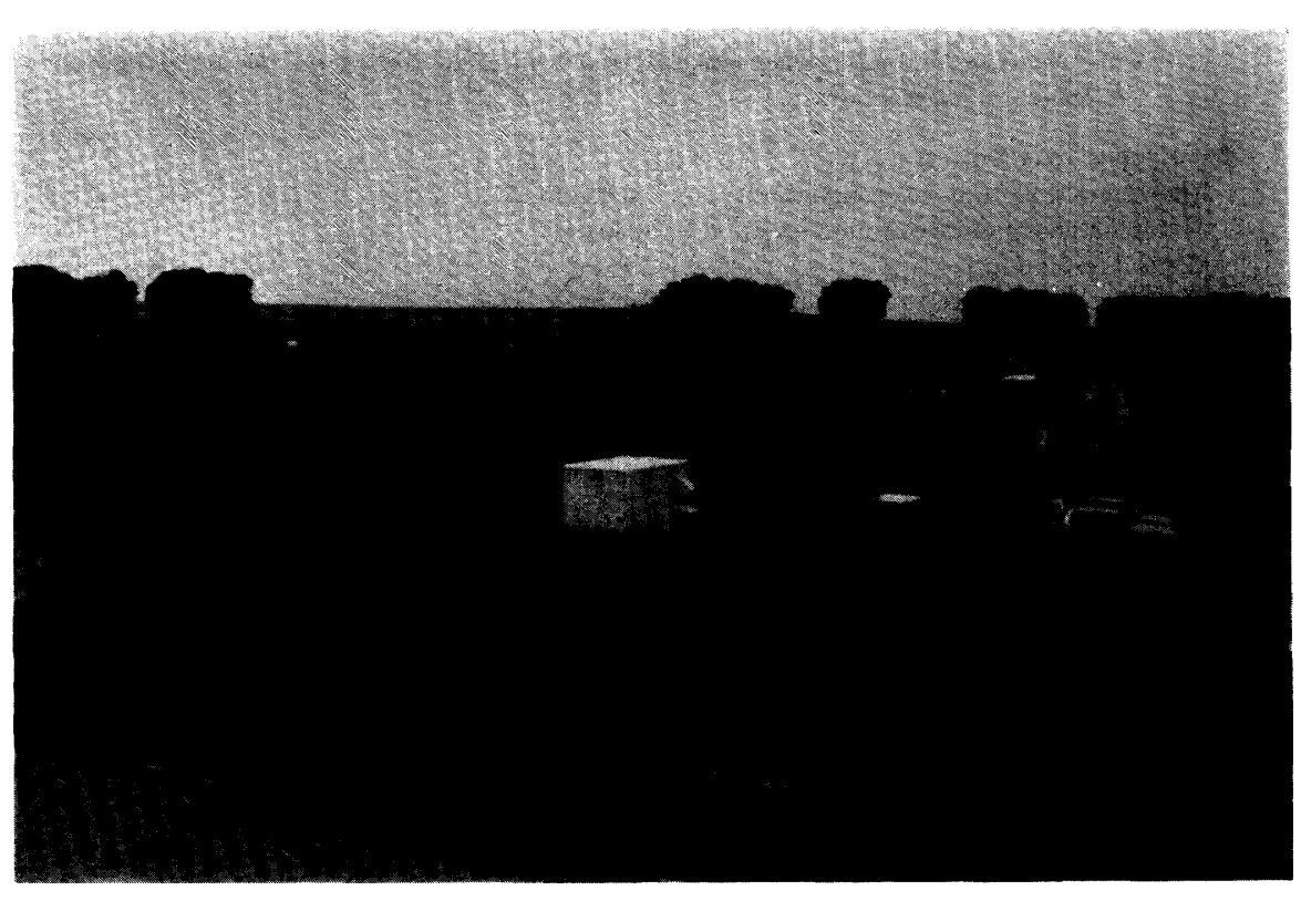
Fig. 1. Picture of the wind profiler at the NOAA test site in Platteville, Colorado. A white cabin in the center of the photograph is an equipment shelter, and antenna array is seen in front of the shelter.

Search and Rescue Satellites (SARSATs), NOAA is in the process of obtaining a new frequency for wind profilers. Indications are that the new frequency will be 449 MHz.