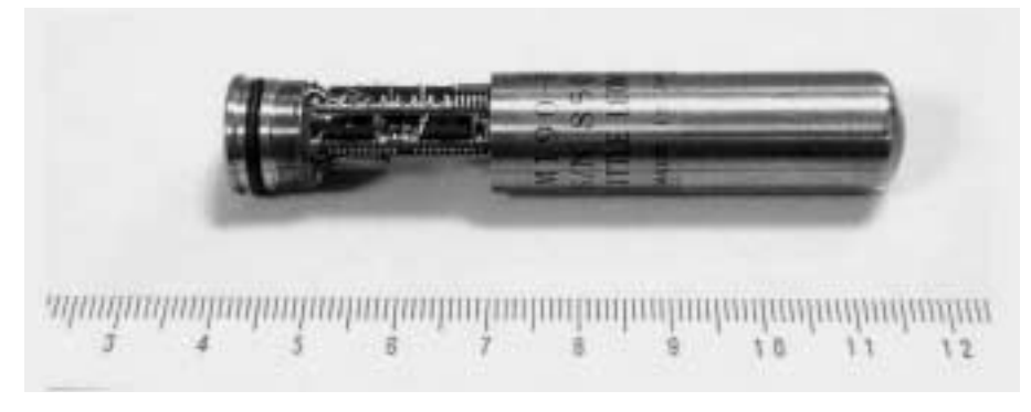
Fig. 2. An example of a data logger (Model M190-DT).