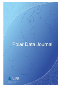
Polar Data Journal

https://www.sciencedirect.com/journal/polar-science