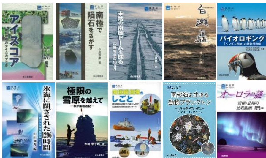
KYOKUCHIKEN Library (Only in Japanese)