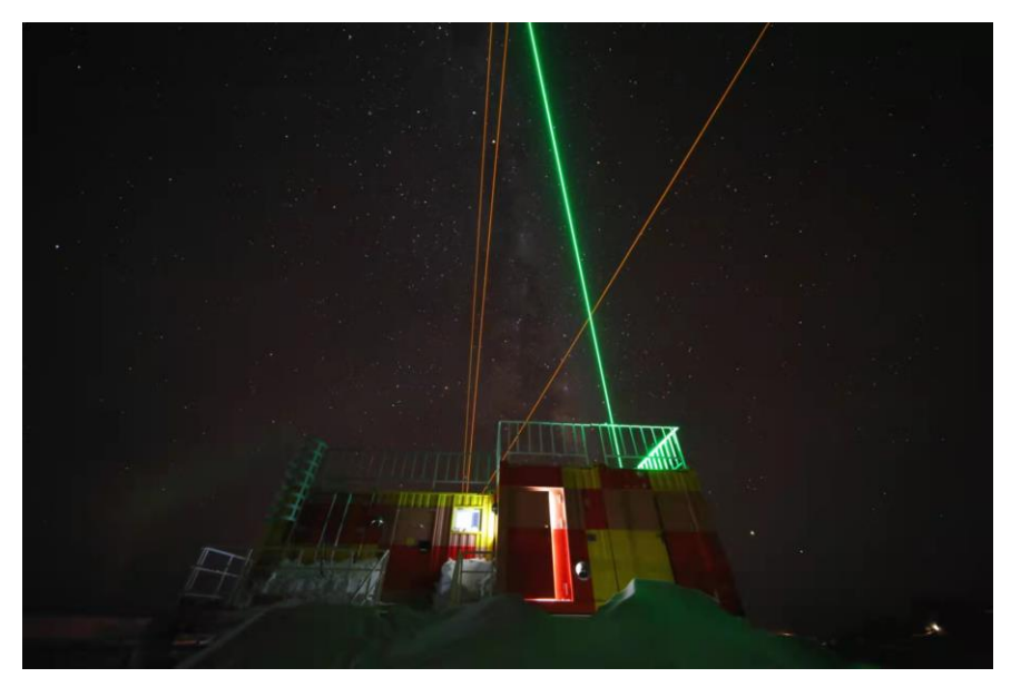
Figure 1. PALOS makes coordinated observation during polar night.

The deployment and the operation of PALOS are mostly supported by Chinese National Antarctic Research Expedition (CHINARE), and thousands of hours of observation data have already been accumulated, which can be used to study the basic characteristics of the polar atmosphere, the thermal/dynamic processes in middle and upper atmosphere, etc. When PALOS makes coordinated observation (Figure 1), silmutaneously observed temprature profiles covering most part of the neutral atmosphere can be provided as shown in Figure 2. We have observed very active sporadic and thermospheric Na layers, which are associated with the activites of sporadic E layers (Es) and aurora. Continouse horizontal winds and temperature data covering mutiple days in the mesopause region also reveals strong atmospheric wave activities above Zhongshan Station. More researches are in progress based on these valuable data set.