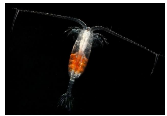
Fig. 2. Image of living Copepoda, Calanus propinquus Brady, Female.