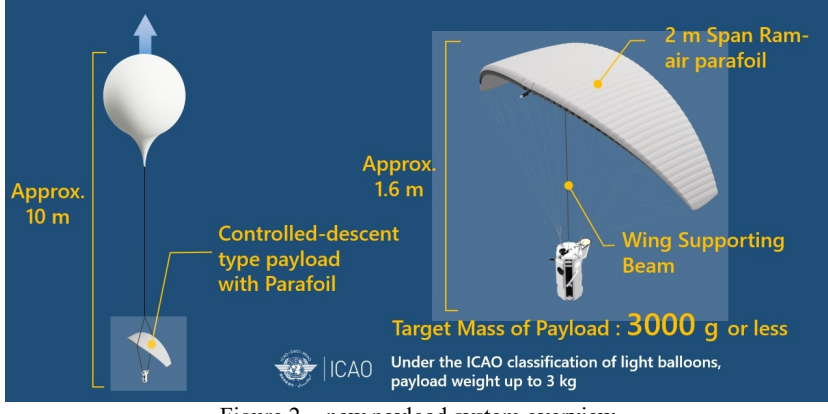
Figure 2. new payload system overview.