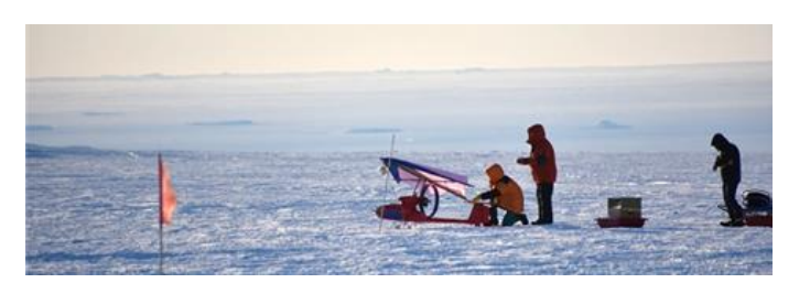
Figure 1. Photo just before "Take off" of Kite Plane at S17

The campaign using Kite Planes at S17 was succesfully performed and obtained interesting dataset for distribution of aerosol number concentration, condensation nuclei concentration, aerosol constituent, and meteorological data. We will show detailes of results on transportation and nucleation of aerosol around S17 and Tottsuki in January 2017.