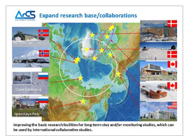
Figure 2. Pan-Arctic research/observation sites.