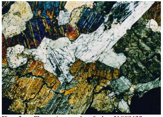
Fig. 2. Photomicrograph of the Y-980433 cumulate eucrite of NIPR. Cross polar, width 6.6mm.