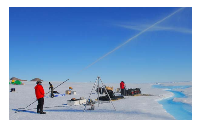
Figure 1. Hot water drilling on Langhovde Glacier, Antarctica.