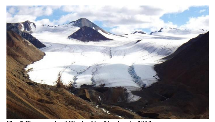
Fig. 2 Photograph of Glacier No. 31 taken in 2013 This glacier was intensively studied by Russian scientists during IGY.