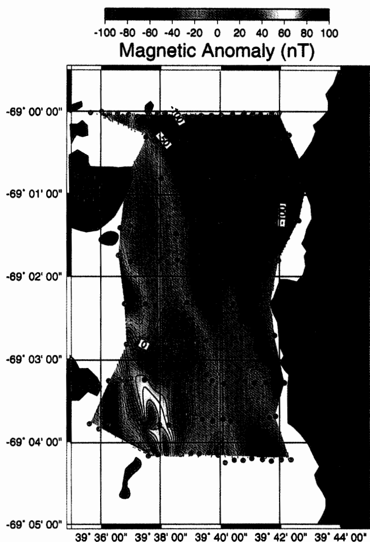
Fig. 2. Distribution of the observation points (shaded circles) and color image of magnetic anomalies in Ongul Strait. The color scale is shown in the upper center. The contour interval is 10 nT. Solid and broken lines show positive and negative magnetic anomalies respectively.

the horizontal plane. The observation points are shown in Fig. 2. Some observation points are slightly shifted from the east-west observation lines due to icebergs. The survey in the northern part of the study area was performed on August 8th and that in the rest of the study area from November 8th to 13th, 1994.