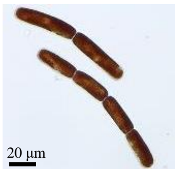
Figure.1 Glacier algae Ancydonema nordenskioldii .