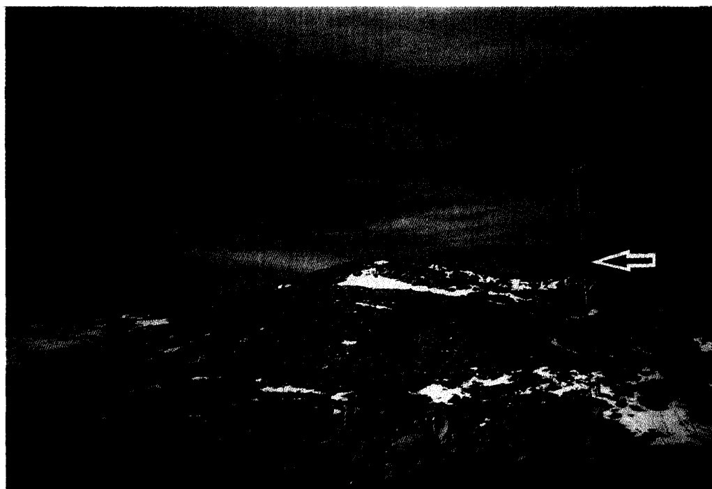
Fig. 2. Landscape around the meteorological observation station (MCS-5) toward the east. Arrow showing a 10 m pole for meteorological observation.