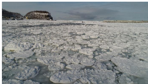
Figure 2. Ice conditions in Utoro port