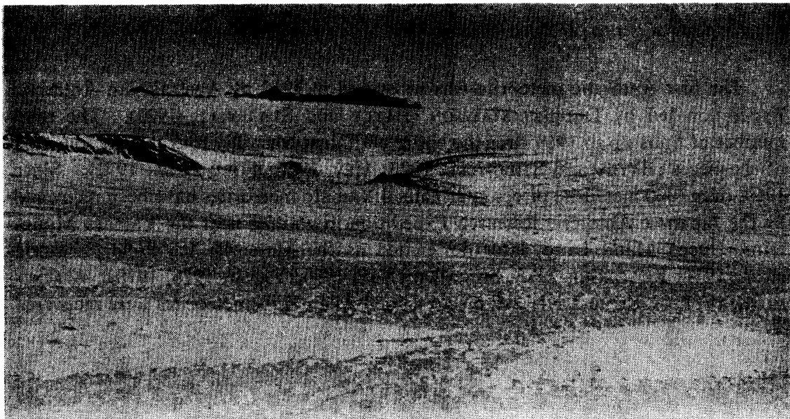
Fig. 2. Bare ice field near Allan Hills, South Victoria Land, viewed from the south in January 1978.

by a joint U. S. -Japan team in the Allan Hills, South Victoria Land (CASSIDY et al. , 1977; YANAI, 1978b, 1979; YANAI et al. , 1979). As shown in Fig. 1 Antarctic meteorites were found at eight localities until 1978.